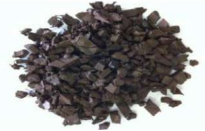
Fig 2.1 Chipped rubber tyre of size 20mm

A typical rubber consists of 24 to 28% of carbon black, 40 to 48% of natural rubber and 24 to 36% of synthetic rubber. The used rubber tyres are collected from the remoulding shops and cleaned for further use [14]. These rubber tyres are cut into chipped aggregate of maximum nominal size more or equal to 20mm. These tyres are sieved and the rubbers are collected for replacement work [15]. Various test where done and the result obtained for chipped rubber aggregates are shown table 2.1.