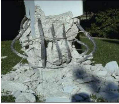
Figure 1: Failure at Construction Joint

Earthquakes are a severe structural hazard that causes vibrations in the structures due to the ground shaking. Other destructive effects on structures due to an earthquake are sliding away from their foundations and their horizontal or vertical movements that may make the structures unsafe. An earthquake is an abrupt movement or tremor of the earth's crust that is initiated below or at the surface. The earth's surface is moving continuously in a slow motion, due to which the plates at the surface also move along the globe[4]. With the movement of the plates, they rub against each other or spread apart, and at a certain point the strain developed exceeds the capability of the plates to withstand more forces and they break, causing an earthquake. At the construction joins, the bending moments and shear forces are maximum. During earthquakes, the structural damages are mostly seen at the joints[5]. The diagonal cracks at the joints are due to the insufficient shear reinforcement in the structures. Rehabilitation and retrofitting strategy must reduce these deficiencies from the structures.