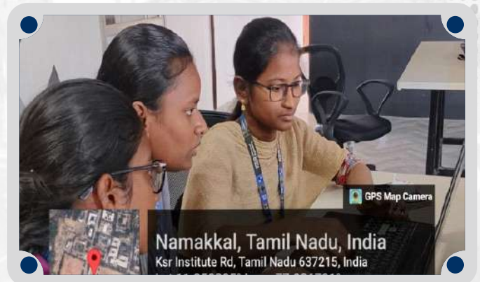
Azhizen Solution, Tiruchengode