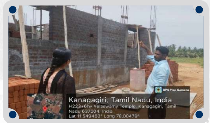
QIA Constructions Design and Builders, Salem