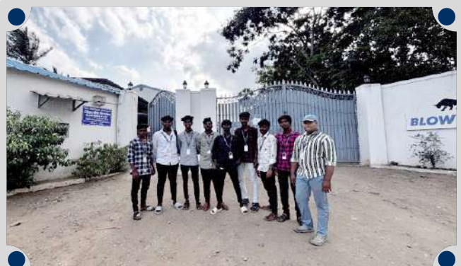
Blow King Plastics, Tiruppur