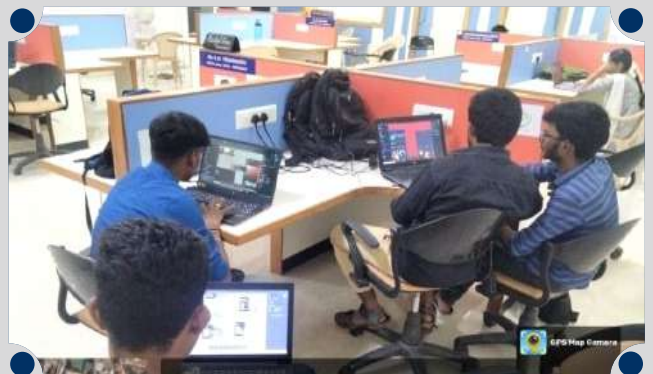
Imagivite Pvt Ltd, Namakkal