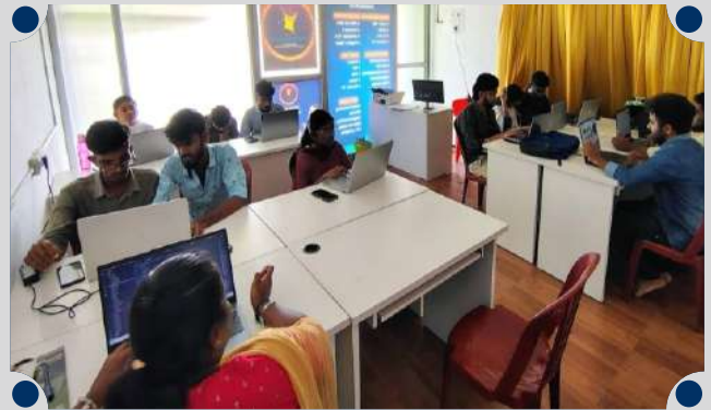
Infronex IT Products and Services, Coimbatore