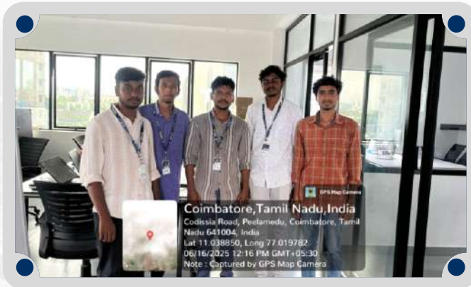
Ancit Technologies, Coimbatore