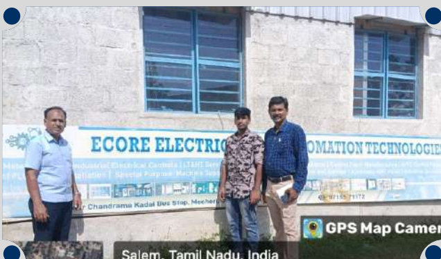
Ecore Electricals and Automation Technology, Salem