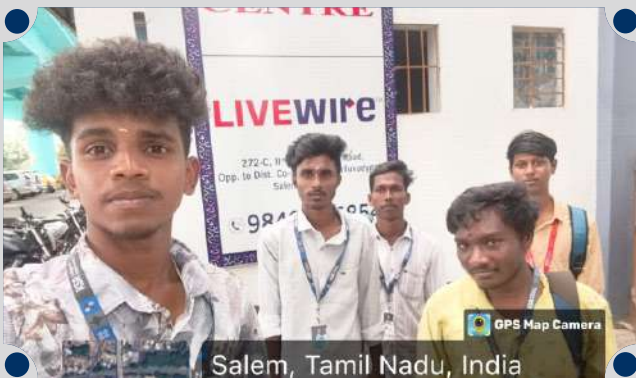
CADD Centre, Salem