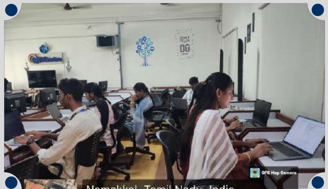
Namakkal, Tamil Nadu, India