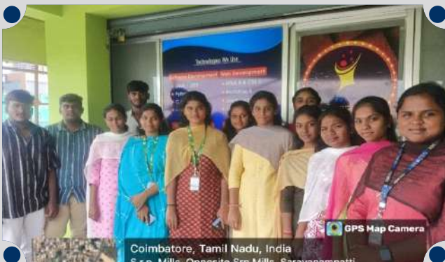
Infronex IT Products and Services, Coimbatore