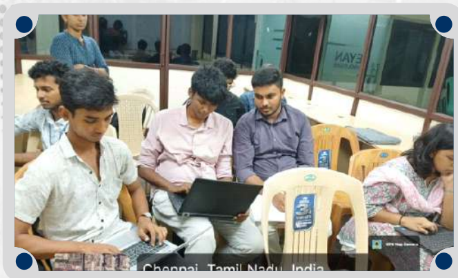
Inetz Technology, Chennai