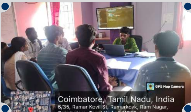
Coimbatore, Tamil Nadu, India 6/35, Ramar Kovil St, Ramarkovk, Ram Nagar, Coimbatore, Tamil Nadu 641006, India