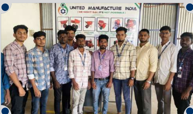
United Manufacturing India, Sankari