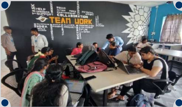
Azhizen Solutions, Tiruchengode