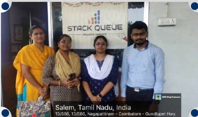
Salem, Tamil Nadu, India 13/566, 13/566, Nagapattinam - Coimbatore - Gundlupet Hwy.