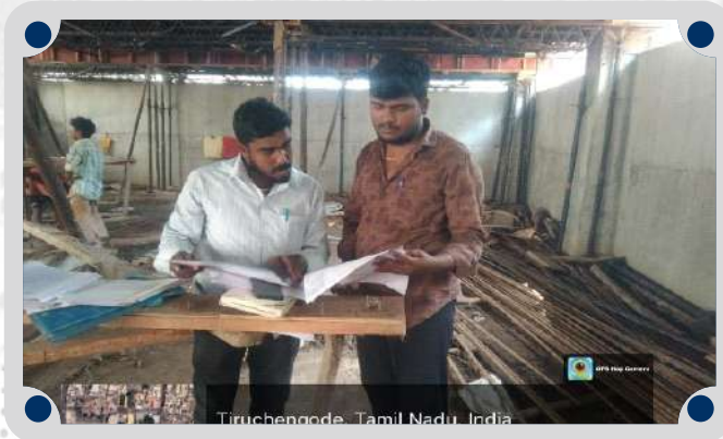
IQ Building Solutions, Tiruchengode