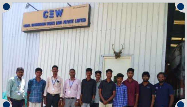
Coral Manufacture Works, Erode