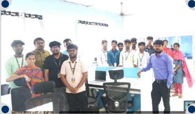
Arpina Solutions, Hyderabad