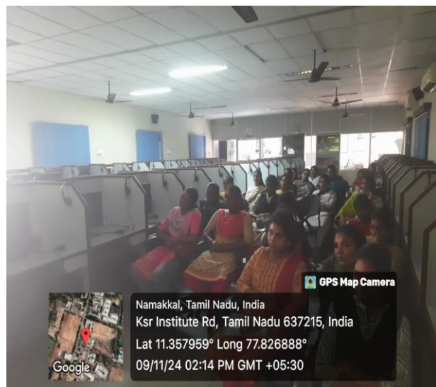
From the Classroom to the Screen: Students Review the Movie