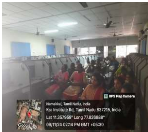
From the Classroom to the Screen: Students Review the Movie